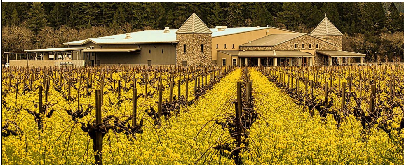
Girard has been based in Calistoga since 2018, but the winery uses Cabernet grapes from several Napa Valley subregions.

New reviews of Cabernets and blends from the top California region, up to 91 points